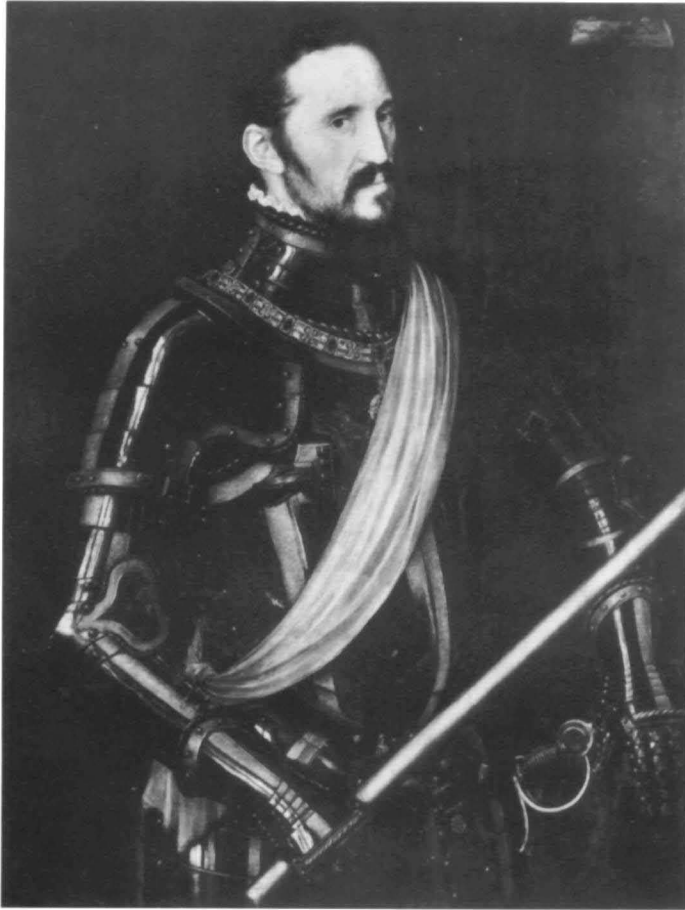
Fig. 9. Antonius Mor, Portrait of the Duke of Alva (1549). New York, The Hispanic Society of America.

maid he does this for the benefit of a subject which must be considered as belonging to the thematic realm of 'rhyparography'. In contemporary literature and art, maerten , scullery maids, function as personifications of the senses and, in particular, lust. Their traditional typology has sinful, even devilish connotations, especially when they are shown handling a roasting-spit with meat. 19 In Aertsen's Kitchen maid , in other words, a pejorative figure is surrounded with an aura of authority and dignity created by the location of the kitchen maid in an 'antique' ambience. (If the ambience proposed here chimed with a 16th century reality, then it must have been a particularly genteel kitchen.)