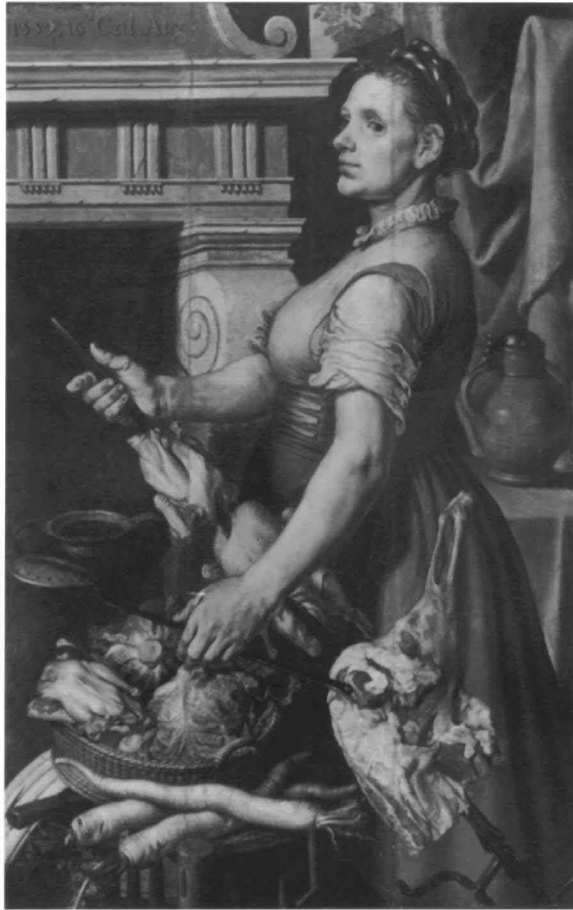
Fig. 8. Pieter Aertsen, Kitchen maid (1559). Brussels, Musées des Beaux-Arts.

That Aertsen was indeed aiming to evoke such associations can also be seen from his borrowing from engravings in Pieter Coecke van Aelst's 1546 edition of Serlio's architectural treatises. In various paintings, such as in his Kitchen maid in Brussels (fig. 8), Aertsen has followed Serlio's designs for a fireplace in the Ionic, Doric and composite orders right down to the details. 18 As Serlio's books were intended to communicate the classic architectural canon to his contemporaries in a convenient and responsible manner, it is likely that through the deliberate quotation from this canon Aertsen tries to give his own art the authority of classical art. However, what is most striking is that in the Kitchen