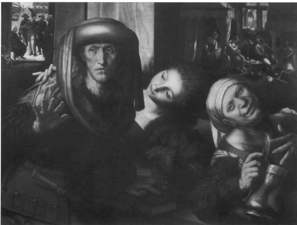
Fig. 14. Jan van Hemessen, Brothel scene . Karlsruhe, Kunsthalle.

classicist loggia in the one painting, a wooden stall in the other — which offers a view through to a landscape showing a small religious scene. Jan van Hemessen's Brothel scene in Karlsruhe of around 1540 (fig. 14) offers a precedent for the enlargement in the foreground of the animal vulgarity of the brothel scene in the right of the background. Van Hemessen's paintings help us to see that the innards on sale in the Meat stall do not differ fundamentally from the merchandise that is being auctioned to the right in the background. However, we cannot say that the composition passed on by Van Hemessen bears the association of a worthy, 'high' visual formula. Otherwise, the ancient Laocoon, which was clearly the model for the stranglehold of the entwined arms of the prostitutes in Van Hemessen's paintings, would have been the classical ideal of composition which Aertsen also had in mind for his arrangement of the naked flesh. In fact, Van Hemessen's Brothel scene with the Parable of the Prodigal Son is itself a fine example of a 'megalographic rhyparography': the classical loggia gives the brothel the status of a Renaissance palace. 25