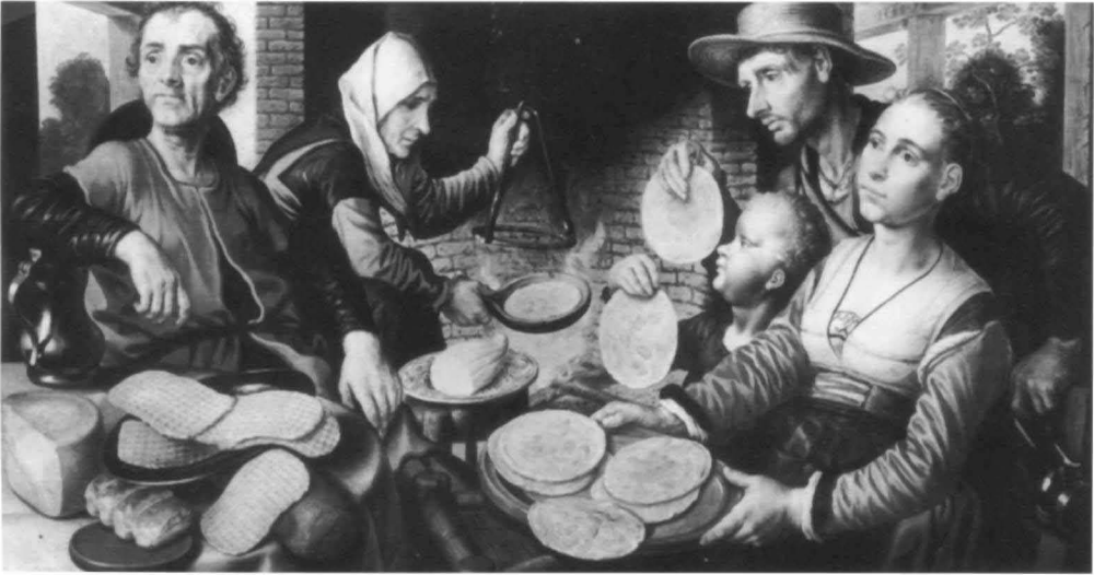
Fig. 11. Pieter Aertsen, Pancake eaters (1560). Rotterdam, Museum Boymans-van Beuningen.