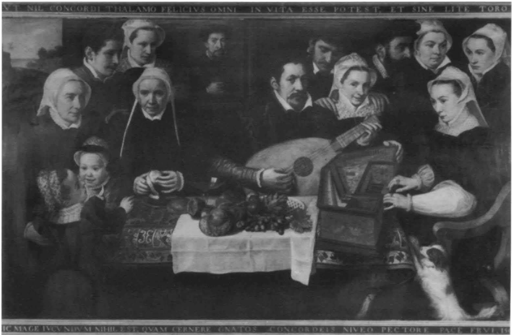
Fig. 12. Frans Floris, Portrait of the Van Berchem Family (1561). Lier, Museum Wuyts-Van Campen.