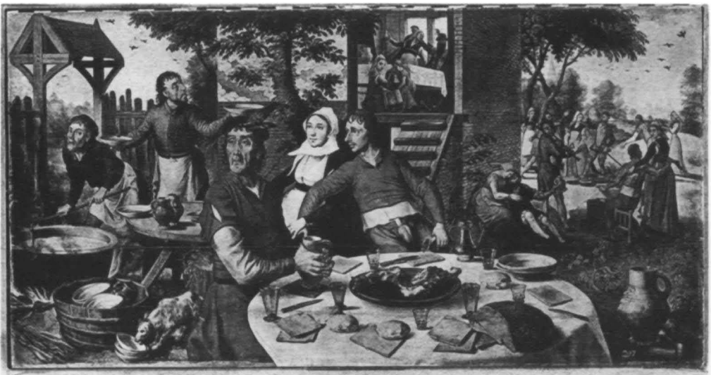
Fig. 3. Pieter Aertsen, Peasant feast (1550). Vienna, Kunsthistorisches Museum.