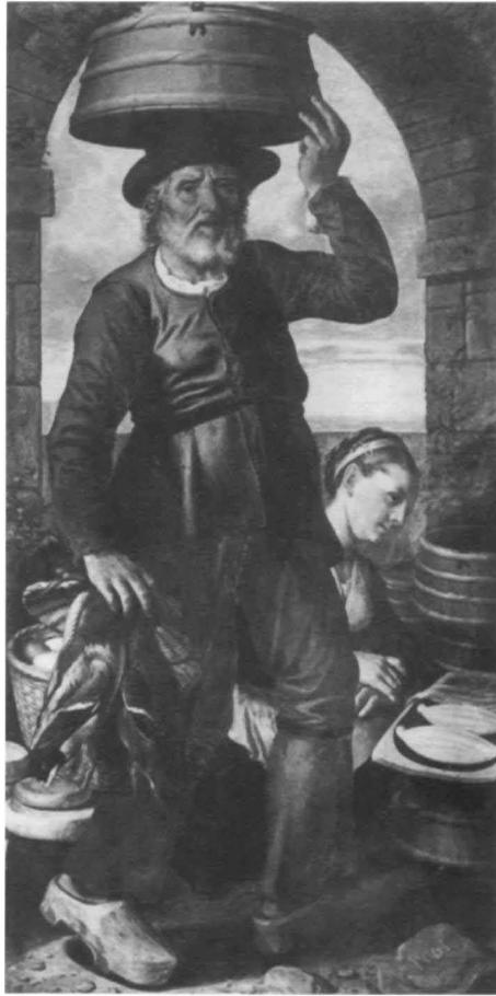
Fig. 5. Pieter Aertsen, Peasant in a niche (1561). Budapest, Museum of Fine Arts.

figure — the ‘paradoxical encomium ’ or paradoxical praise — seems to have played a role in Pieter Aertsen’s experiments. This theory is one which I have aired on a previous occasion; 1 however, new visual material has enabled me to strengthen the basis of my argument and to present it afresh in a somewhat altered shape.