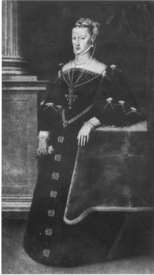
Fig. 10. Antonius Mor, Portrait of Mary of Austria . Madrid, Museo del Prado.

unanimity. 22 Contemporary family portraits by Cornelis de Zeeuw and Maerten van Heemskerck show the same motifs, even if far more space is made here for the festive dishes. 23