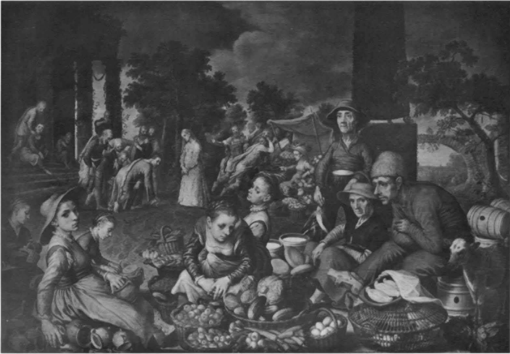
Fig. 6. Pieter Aertsen, Market scene with Christ and the Adulterous Woman . Frankfurt a/M, Städelsches Kunstinstitut.

rather heavysset, and sagging body — is similar to that of the peasant in the right foreground of Aertsen's Market scene in Frankfurt. The red, glowing nose and the wooden pose is a characteristic that he shares with the drunken, dazed and staring old peasant in the foreground of Aertsen's Peasant feast in Vienna. Nevertheless, this peasant still has a certain rough elegance, since, despite the strange twists of his club feet — a peasant contrapposto — he manages with just a couple of fingers to keep a large tub of milk balanced on his head. However, to claim that the figure is 'dignified', as some art historians do 16 — a dignity far removed from the satirical and comical scenes of peasants of Dürer and other 16th-century artists — would seem to be rather crass. And yet there are elements in this scene which, in retrospect, make this association with 'dignity' somewhat acceptable.