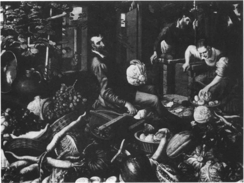
Fig. 2. Pieter Aertsen, Preparation for the market . Rotterdam, Museum Boymans-van Beuningen.