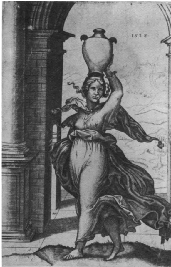
Fig. 7. Marcantonio Raimondi, Woman carrying a vase on her head (1528). Print, after Raphael (Ill. Bartsch 27; 470), Amsterdam, Rijksprentenkabinet.

parallel Sievers saw between the motif of the tub-bearer and the water-carrier in Raphael's fresco of the Borgo fire in the Vatican should be taken with a pinch of salt; just as the parallel drawn between the torso of the peasant's body and the figure composition based on Michelangelo of a frontal upper body and the legs in profile should be considered arbitrary. In Aertsen's time, however, Raphael's and Michelangelo's inventions were, like those of Rosso and Raimondi, quite well-known in the Netherlands and were avidly studied and followed here. But even if the similarity between Aertsen's Peasant in a niche and the niche sculptures is purely a coincidence — which I do not believe — the formula of the niche figure as such is certainly an expression of a Renaissance idiom and suggests associations with the art of the ancient world and so with the dignity of that art.