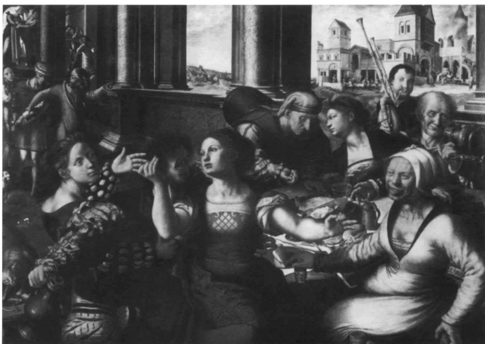
Fig. 13. Jan van Hemessen, Brothel scene with the Parable of the Prodigal Son (1536). Brussels, Musées des Beaux-Arts.

Can the Meat stall (fig. 4) now also be described in terms of a ‘high form’ which serves to depict a ‘low content’? With regard to the composition of this painting as a whole I have not been able to find in the art of the time any examples of a visual formula which could have served Aertsen as a point of departure for his invention, with the exception of a few paintings by Jan van Hemessen. The Meat stall shares a strong close-up of ‘pieces of meat’ in the foreground with Jan van Hemessen’s Brothel scene with the Parable of the Prodigal Son of 1536, in Brussels (fig. 13): there it is prostitutes in a brothel, here an animal meat stall, disposed in an angle towards the background along a slanting structure — a