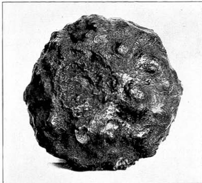
Fig. 2. Manganese nodule in triassic deep-sea deposits, in the vicinity of the mountain Somoholle, district Beboki, Island of Timor. Original size.

Proceedings Royal Acad. Amsterdam, Vol. XVIII.